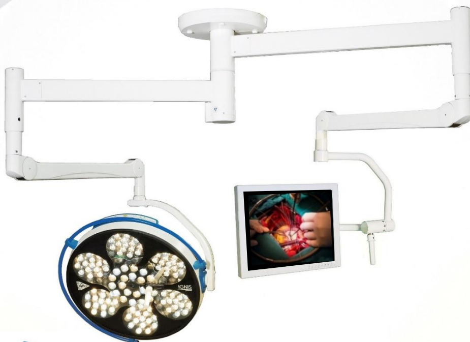
IGNIS 160CAM/TV C