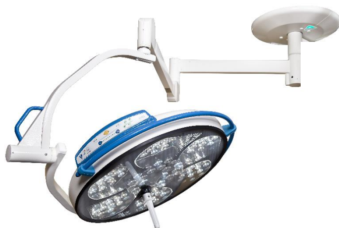
IGNIS 160/160C IGNIS 160CAM/160 C