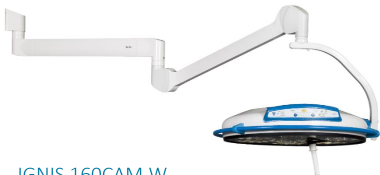
IGNIS 160CAM W IGNIS 160 W