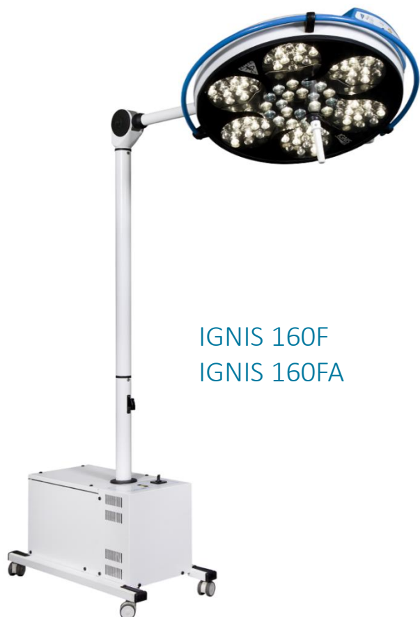
IGNIS 160F IGNIS 160FA