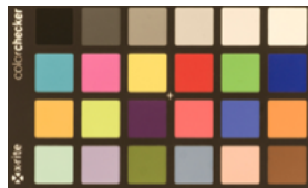
Colors at 3500 K

SOLIS 30FA is made exclusively from heavy duty materials - steel, aluminum and ABS.