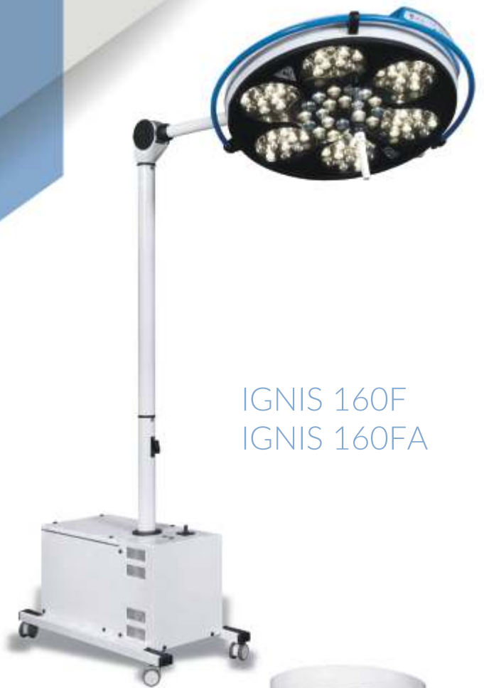
IGNIS 160F IGNIS 160FA