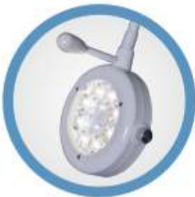
► Ergonomic handle let you easily adjust the light.