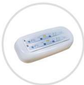
wall-mounted control panel

Medical tablets support remote control of video and audio coming from various medical devices. These are high quality devices, resistant to dirt and mechanical damage.