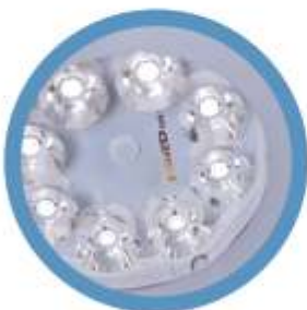
► Lights intensity can be adjusted fluently beetwen 15-100%.

Wherever you need to conduct a clinical exam, SOLIS 30 will be at your side to guarantee optimal lighting in all situations. SOLIS 30 light delivers 30 000 lux at 1 m, providing ideal illumination for all medical specialities. With faithful colour rendering (CRI 96), the SOLIS 30 is particularly well suited for dermatology. The use of LEDs ensures that the light does not give off heat. With rail-mounted, mobile, ceiling and wall versions available, SOLIS 30 is suitable for all work environments. To make practitioners' everyday tasks easier and avoid maintenance problems, the SOLIS 30 uses LEDs which have a considerably longer service life than halogen bulbs, leaving practitioners free to devote all their time to patients. The round and ultra-flat shape of the light makes the product ergonomic and suitable for any type of installation. Smooth and rounded shape of the dome make it easy to clean and disinfect. The radial layout of the lenses and lamp diameter permit shadow suppression and three-dimensional lighting.