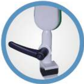
► Rail mounted version.