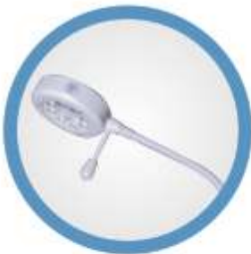
► Goosneck arm highly increases the manoeuvrability of the lamp.