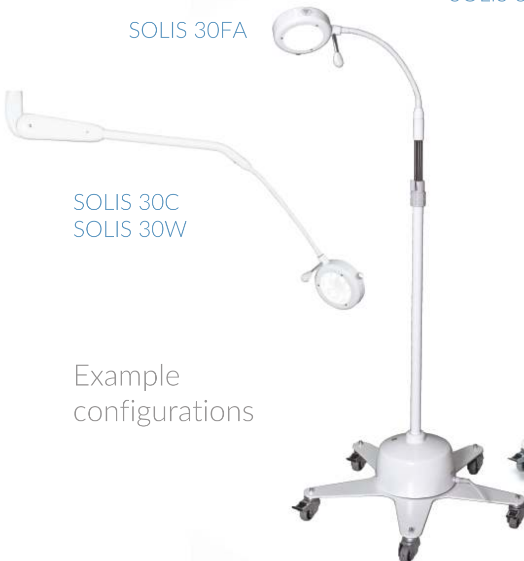
SOLIS 30C SOLIS 30W